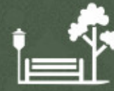
Senior Citizen Seating